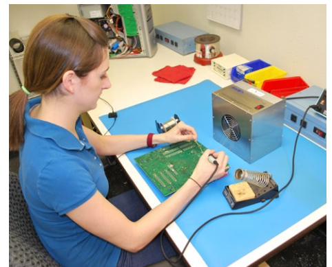
The Model 100 Stainless-Steel Solder Sentry is compact and takes up minimal benchtop space.