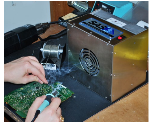
Operator using Model 100 Stainless Steel Solder Sentry to help protect from hazardous soldering fumes.