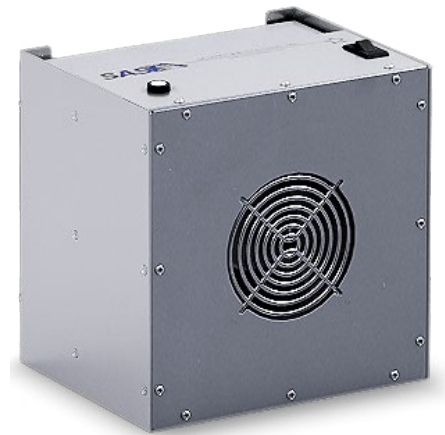
Model 100 Stainless Steel Solder Sentry

The Stainless Steel Solder Sentry offers an effective, quiet, and economical ESD-safe fume extraction solution for many benchtop soldering operations. ESD-safe solutions help prevent electrostatic discharge while soldering to help protect expensive electronic media. All of Sentry Air's products are proudly manufactured in the United States and are backed by our two-year limited warranty on parts and labor.